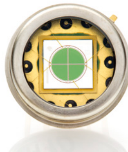
High speed, high sensitivity silicon avalanche photodiodes (APD)

Institutions such as the Fraunhofer Berlin Center for Digital Transformation offer an excellent platform for interdisciplinary R&D cooperation.