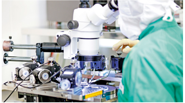
On-wafer chip characterization at Fraunhofer HHI