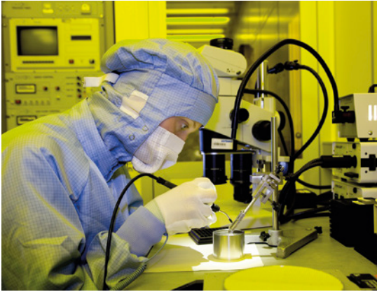
Laser stack assembly at the Ferdinand-Braun-Institut