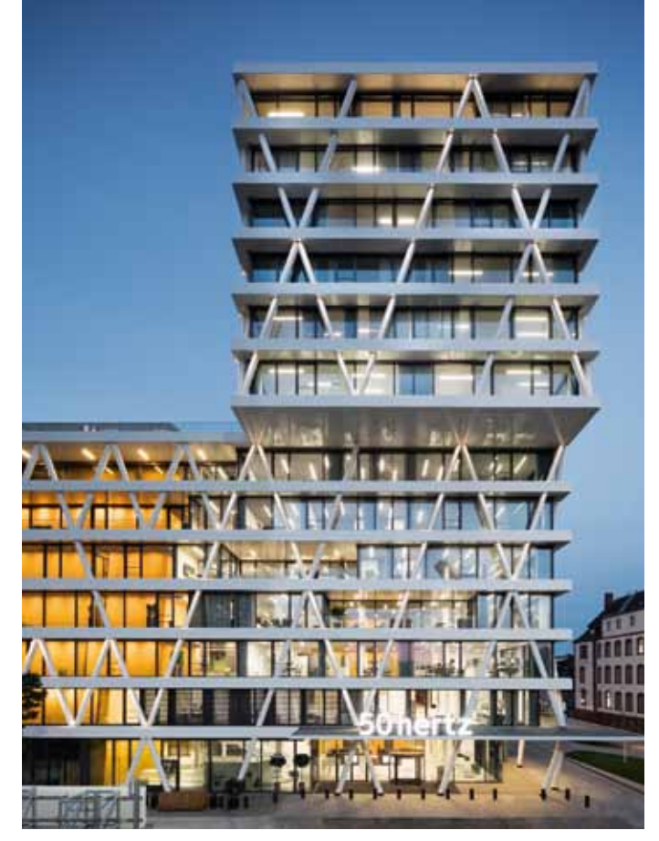
50Hertz headquarters in Berlin

All in all, an energy supply system is being set up in Berlin-Brandenburg with increasingly decentralized, fluctuating power feeders as well as smart control of generators and consumers. The safeguarding of this smart grid infrastructure is pursued through the development and deployment of innovative IT technologies and services and will increase the resilience of energy grids. Since 2017, the WindNODE consortium has been developing a digital infrastructure for the next stage of the energy transition.