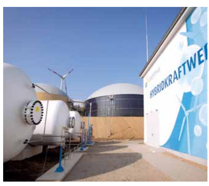
ENERTRAG hybrid power plant in Prenzlau