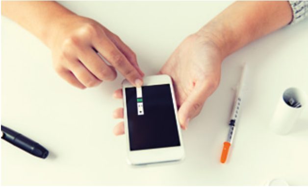
Mobile apps and wearables to support patients suffering from chronic diseases.