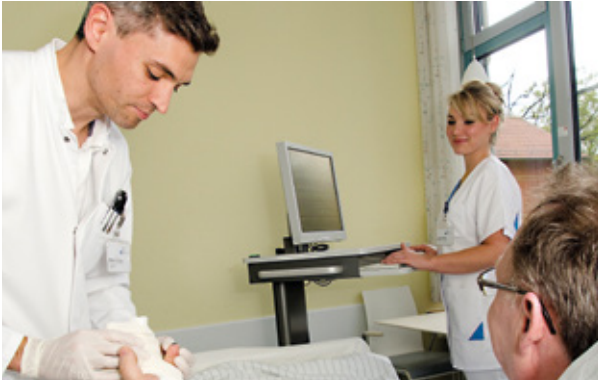
ukb: Patient data and information on prescriptions, treatments and diagnoses can be accessed and documented on the mobile trolley.