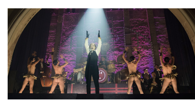
"Babylon Berlin", X Filme Creative Pool

Productions such as "Dark", "Unorthodox", "Munich – The Edge of War", "The Queen's Gambit" or the current mystery series "1899" from "Dark" creators with a virtual stage in Babelsberg all speak for themselves. Brilliant locations and the internationally experienced film creators of all trades make the region one of the most attractive worldwide, not just for us but also for other streaming services, studios and film productions.