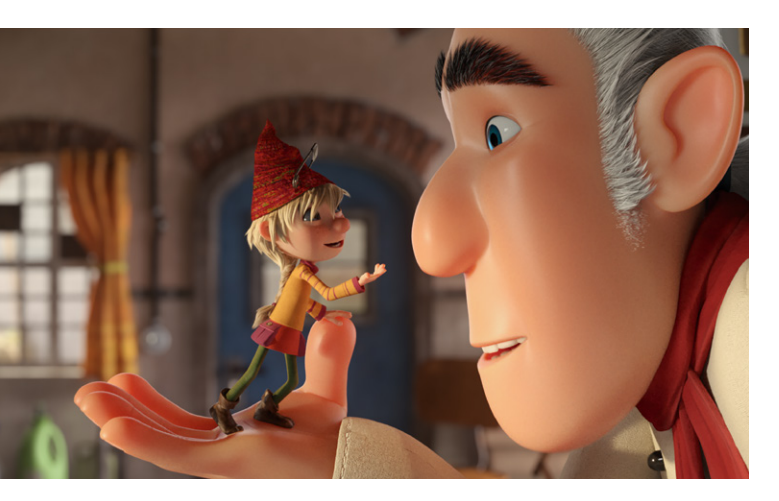
"The Elfkins I Baking a Difference", Akkord Film Produktion