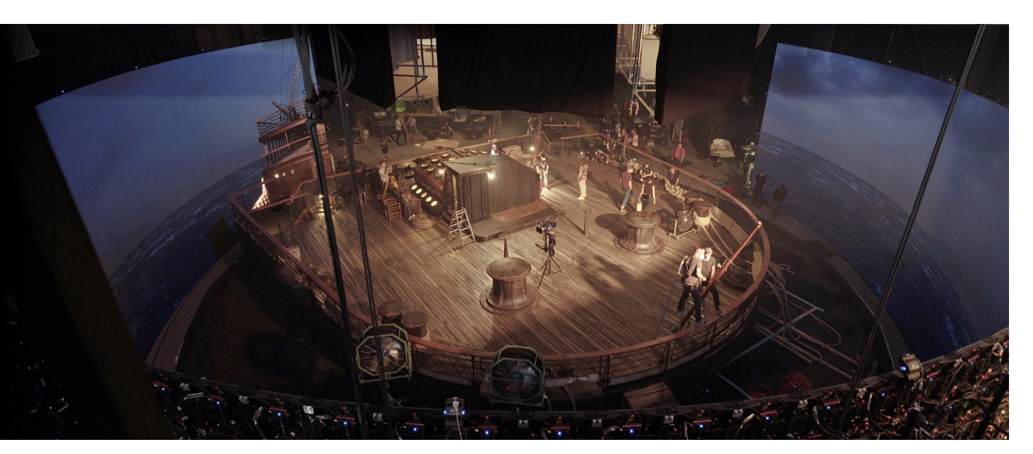
"1899", Dark Bay Virtual Production Stage