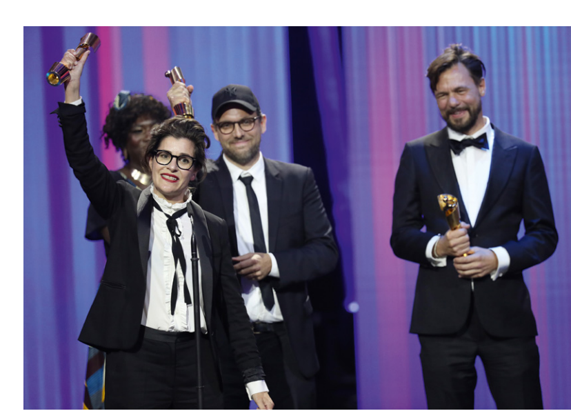
German Film Prize 2021 award ceremony

The Virtual Reality Berlin-Brandenburg association (VRBB), which organises the VR Now Awards, connects the regional stakeholders in the areas of VR, AR and XR.