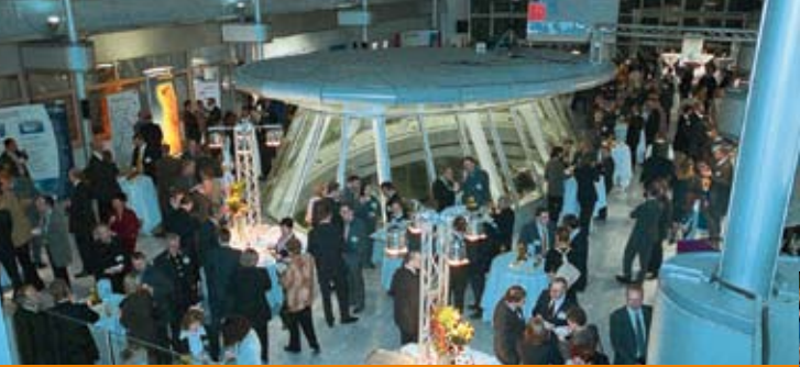
Ludwig Erhard Haus: Headquarters of Berlin Partner GmbH, Berlin Chamber of Commerce and Industry, and the Berlin stock Exchange

www.berlin.de/sen/wirtschaft/branchen/tzgz.html