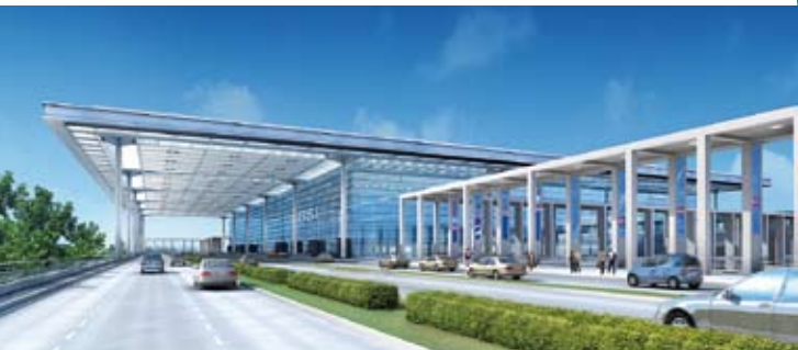
Berlin Brandenburg International Airport BBI in 2011