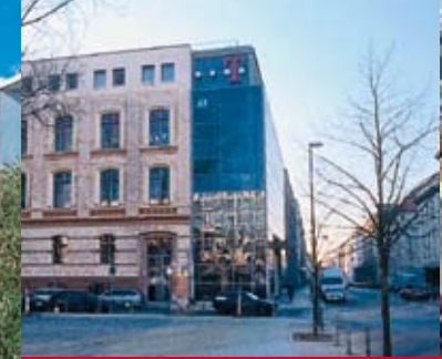
Capital city offices of Deutsche Telekom AG