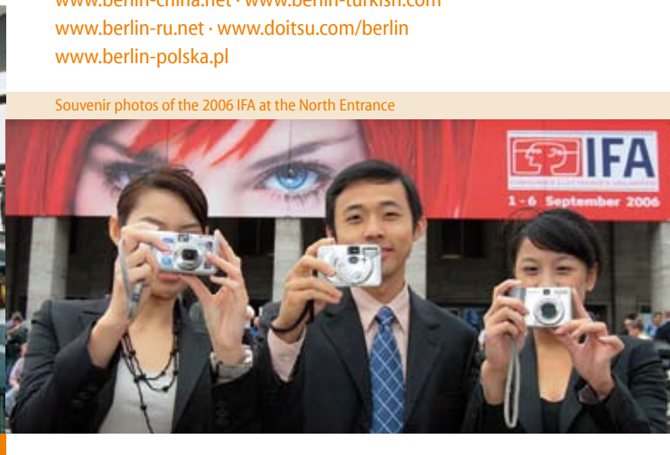
Souvenir photos of the 2006 IFA at the North Entrance