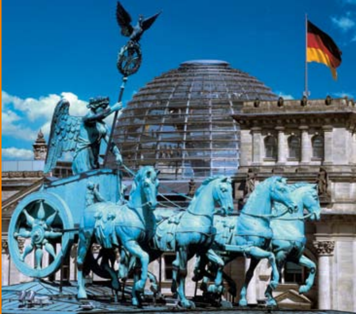
Quadrige on the Brandenburg Gate and the Dome of the Reichstag Building