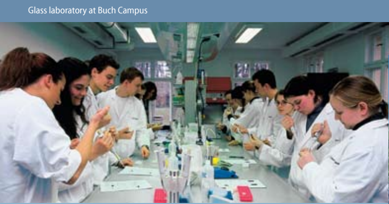
Glass laboratory at Buch Campus

www.berlin-sciences.com www.berlin-partner.de/recruitingpackage