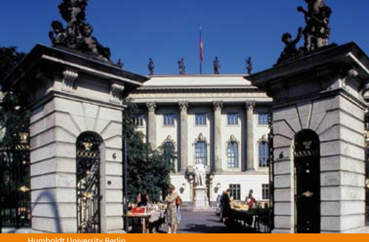
Humboldt University Berlin

www.businesslocationcenter.de > Real Estate Portal