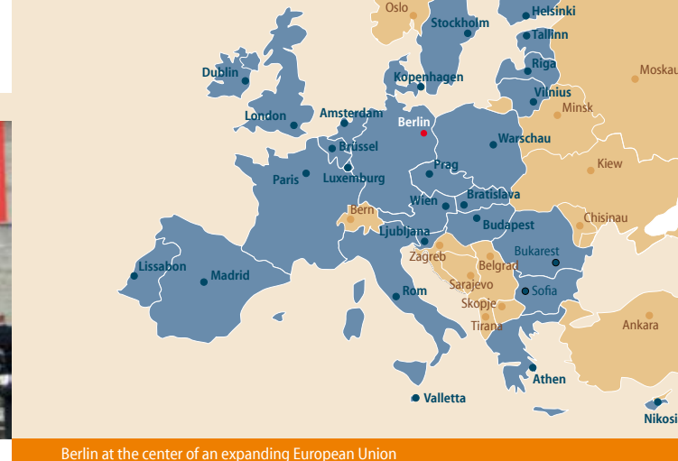
Berlin at the center of an expanding European Union