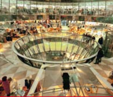
Galeries Lafayette on Friedrichstrasse

Working Together for Berlin Approximately one-third of the world's 50 largest companies are active in the Berlin-Brandenburg region. Many small creative firms provide the basis for these industry giants. Companies that choose Berlin as a business location know to take advantage of the unique commercial and geographic advantages that the city offers.