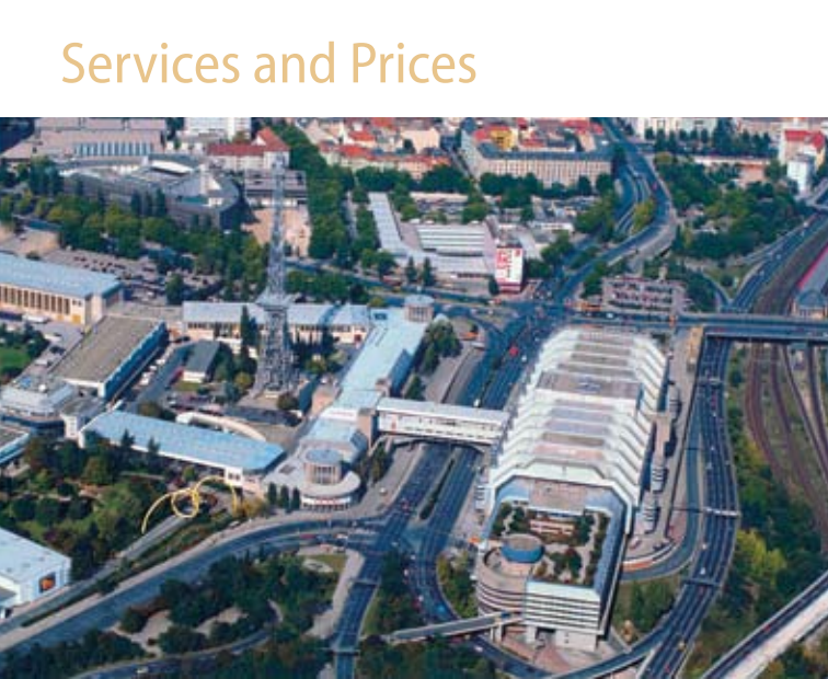
ICC International Congress Center and Trade Fair Berlin