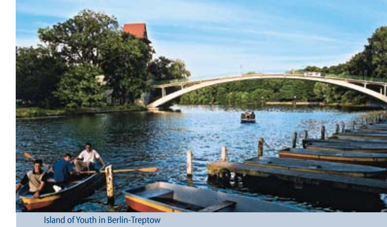
Island of Youth in Berlin-Treptow

A Great Place to Live The high quality of living in Berlin is one of the most persuasive arguments for investing in the city. Despite its size, the city is a green metropolis: 30 percent of the city's surface is made up of forests, parks, lakes, rivers, and canals. Berlin's proximity to the beaches of the Baltic Sea and the lakes and forests of Brandenburg also adds to the number of leisure activities available to Berliners. Berlin offers a wide variety of shopping opportunities. In fact, the city has over 60 department stores and shopping centers – the most in any German city – including the famous upscale "Kaufhaus des Westens" (KaDeWe). More than 7,000 restaurants, bars and pubs throughout the city invite you to enjoy their hospitality.