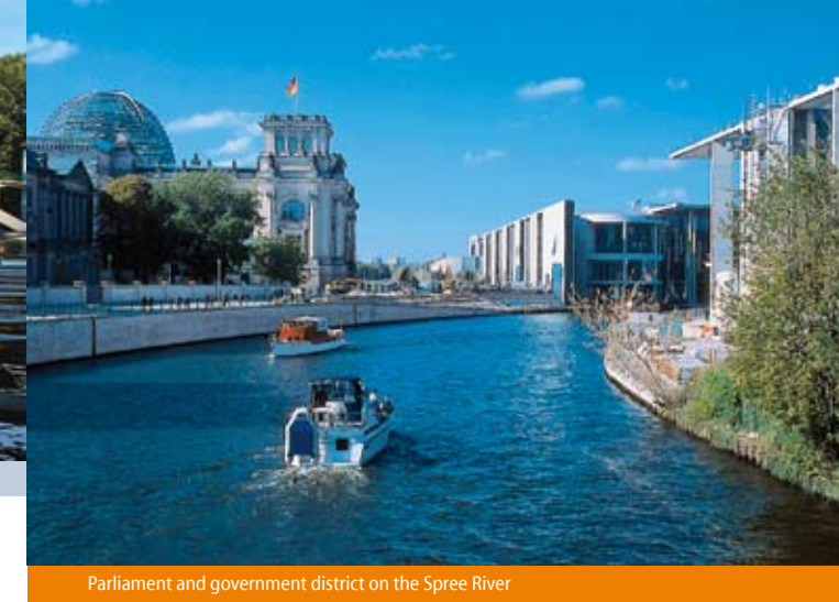
Parliament and government district on the Spree River