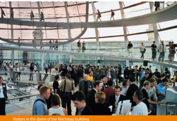
Visitors in the dome of the Reichstag building