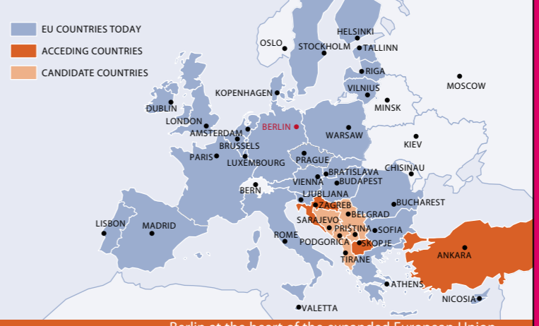
Berlin at the heart of the expanded European Union

Berlin lies on an east-west axis between Moscow and London and on a north-south axis between Stockholm and Rome. The city is the gateway to emerging markets in Central and Eastern Europe and to the economic regions in Western Europe. This is where trans-European traffic routes come together. Nowhere else in Germany is there such a large number of people with knowledge of the Eastern Europe countries, cultures, languages and social systems. A growing number of national and international corporations are opening subsidiaries in Berlin. Local citizens experience the city's flourishing diversity on an everyday basis and actively take advantage of its multicultural infrastructure that unites Eastern and Western Europe.