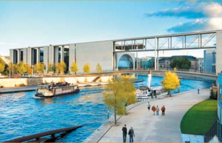
Marie-Elisabeth-Lüders Building in the government district