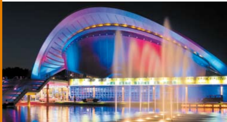
House of World Cultures

Berlin is a truly fascinating city. The collaboration and interaction between Berlin's cultural institutions and its vibrant alternative scene is a major factor contributing to the city's unique cultural dynamics. More than any other city in Germany, Berlin serves as a source of new ideas and attracts innumerable artists and creative minds. Berlin's calendar lists countless events every day of the week. Each year, the city's museums attract more than 12 million visitors; 2.8 million people go to see performances on Berlin's stages. Museum Island with its five exquisite collections is world-renowned. Some of Berlin's most popular events include the Long Night of the Museums, the Berlin International Film Festival, the Carnival of Cultures, the Fête de la Musique, and Christopher Street Day.