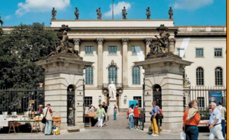
Humboldt-Universität zu Berlin