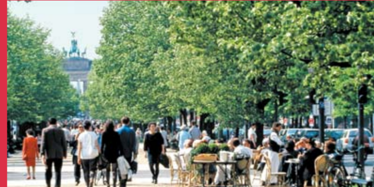
Street café, Unter den Linden

Excellent quality of life in a friendly, green city. Berlin is a cosmopolitan city with plenty of space for a diversity of lifestyles.