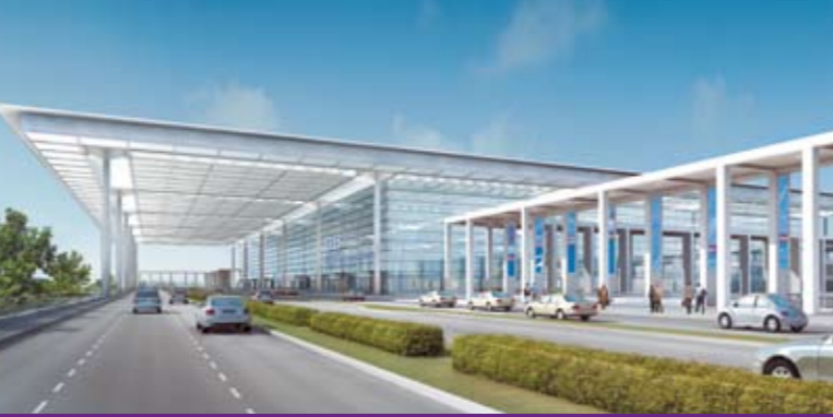
Airport Berlin Brandenburg International BBI

As the largest infrastructure project in former East Germany, the new Airport Berlin Brandenburg International BBI scheduled for completion in 2011 will cover an area of 1,470 hectares (5.67 sq. miles). Dedicated autobahn access and a trans-regional railway station located on the lower level of the main terminal ensure fast and efficient service to the city center. The new airport is equipped to handle over 6,500 arriving and departing passengers per hour. Energy consumption at BBI will be optimized by state-of-the-art heat recovery and renewable energy systems.